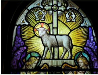
Behold the Lamb of God

Next week : Jnh 3:1-5, 10; 1Cor 7:29-31; Mk 1:14-20